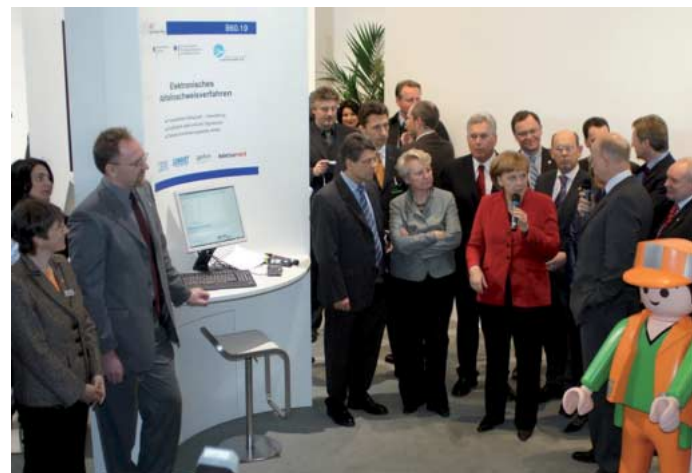
Chancellor Merkel was interested in the development of the ZKS-Abfall project

Starting in 2010, all parties involved in the disposal of hazardous waste will be required to use the electronic records procedure.