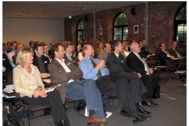
An interested audience at Modawi information day in Hamburg

In the middle term, for every process and every application environment in waste management there will be a signature solution.