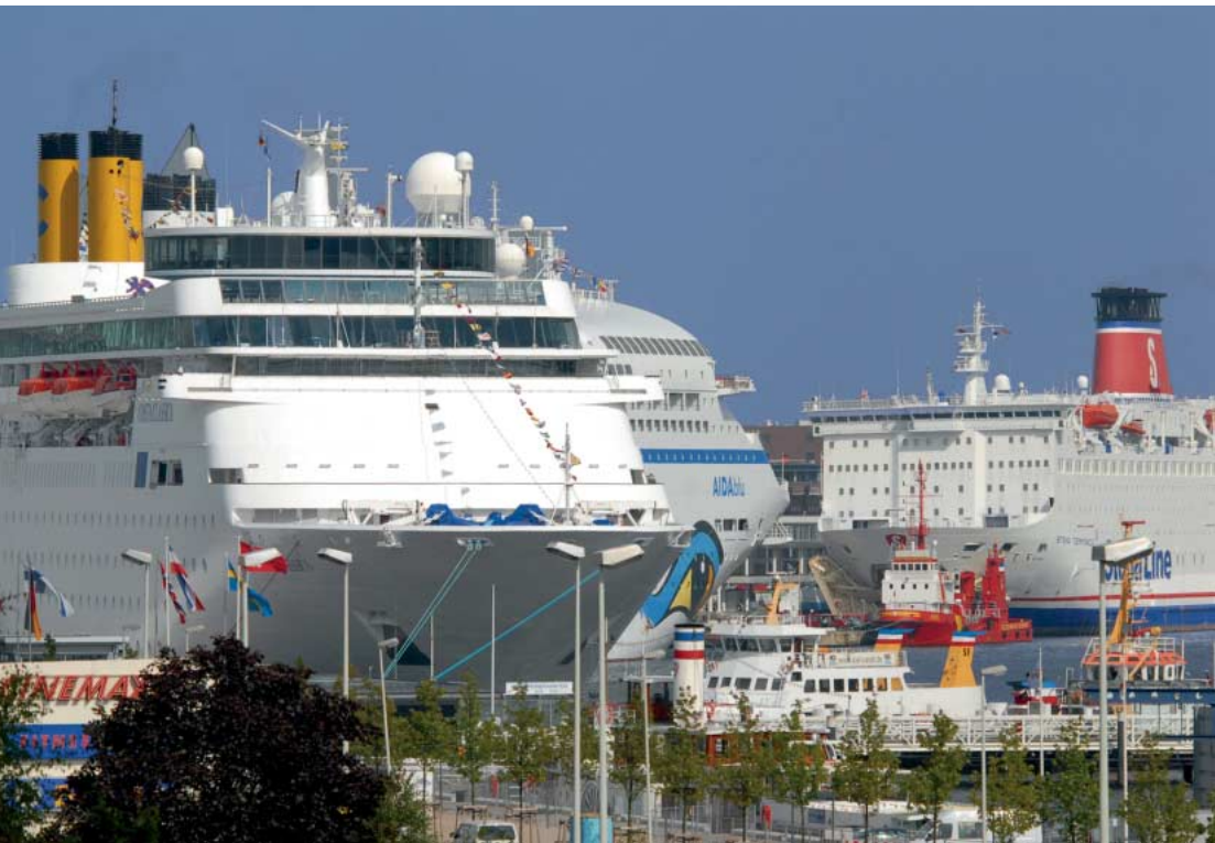
Cruise ships in Kiel harbor

Kiel is the meeting point for cruise ships from around the world