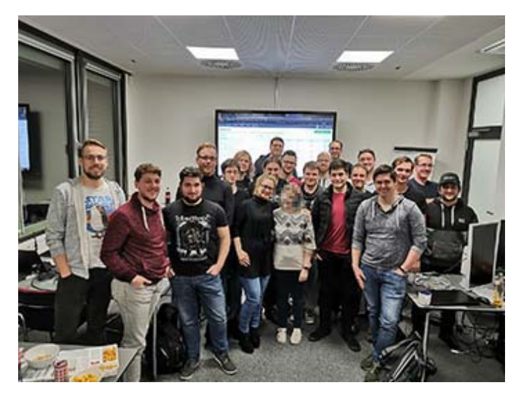
Participants of Hacking Night on 14.11.19 at Consist