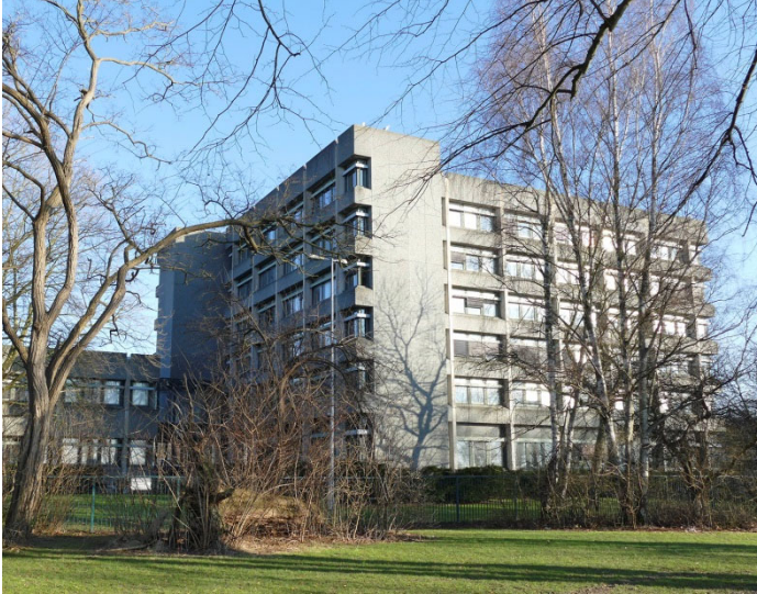
The big new headquarters of Consist Software Solutions at Christianspries 4 in Kiel enables further company growth.