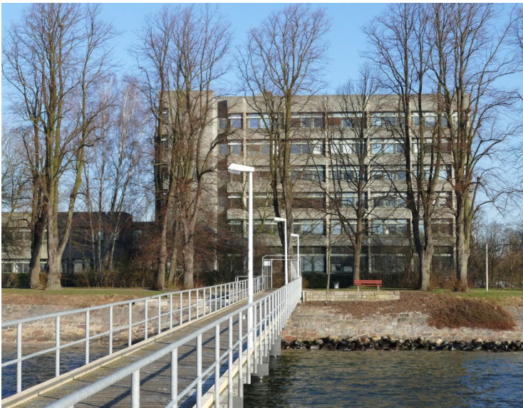
At their new location, Consist Software Solutions offers modern, attractive jobs right next to the ocean.

Consist Software Solutions GmbH A Consist World Group Company