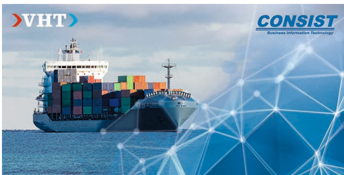
More Cyber Security on board: Cooperation of VHT and Consist, Source: Consist Software Solutions